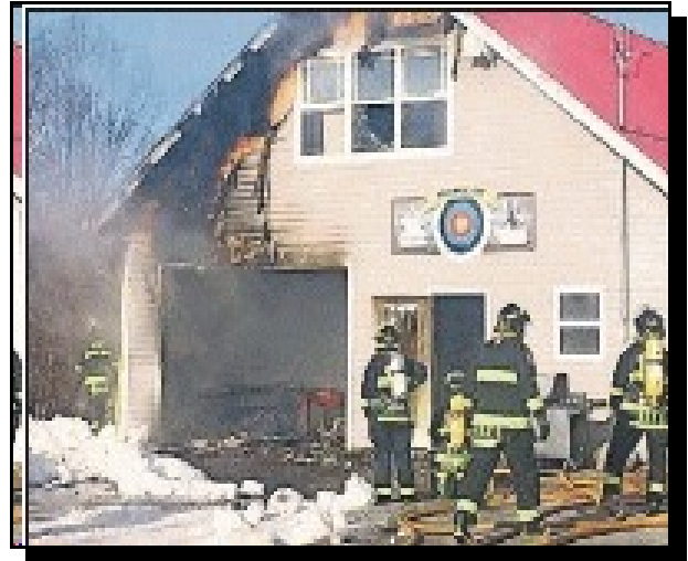
Archery Club weekend Blaze

The owner of Cass' Creek Archery Club said he has been devastated after a fire ravaged through the club's archery centre on Saturday morning, destroying an estimated $100,000 of equipment.